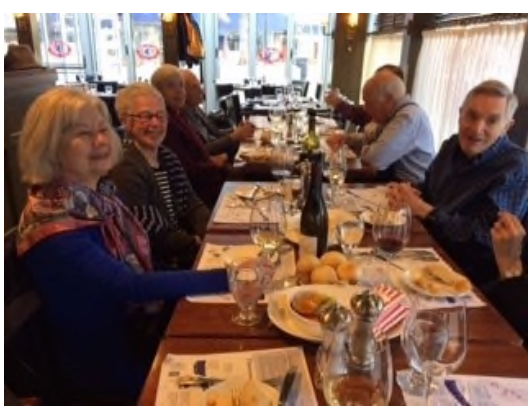
CAH members enjoying their monthly Tipple at Legal Sea Foods in March.

"I've been going to Tipple since I joined Cambridge at Home back in 2008. It's a great opportunity to welcome new members and catch up with more familiar faces. I enjoy the company of fellow members and learning more about their lives, both past and present."