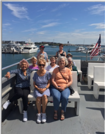
CAH members enjoying the ferry ride to the Peabody Essex Museum in Salem.

We want to send a warm welcome to our newest members!